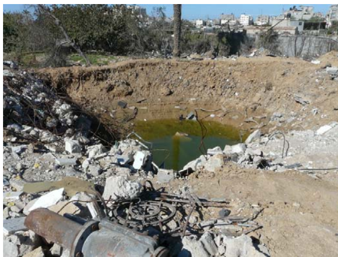
Sewage mains in northern Gaza destroyed by Israeli air strikes in December 2008/January 2009

Israeli forces have also damaged water facilities when demolishing Palestinian houses and property, often using D9 armoured bulldozers to dig up roads and rip through water and sewage pipes. These bulldozers have claw-like rippers which are attached at the rear and thus not of use in detecting or protecting the bulldozer operators against hidden explosive devices. These are used to dig up the road or terrain behind the bulldozers as they drive forward and are clearly intended to cause serious damage to roads and anything else in the bulldozers' wake.