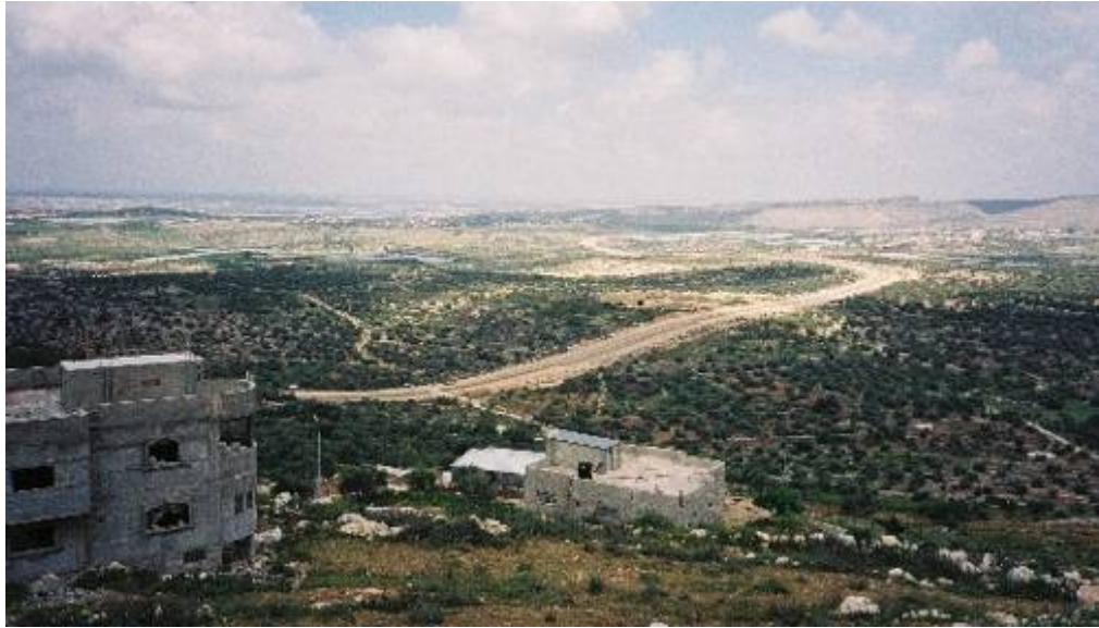
Jayyus' land with the fence/wall snaking through the landscape

An examination of the map showing the line of the fence/wall around Jayyus indicates that its route was determined with land grabbing, rather than “security” considerations, in mind. The fence/wall makes a large loop around the Israeli settlement of Tzufim, itself built on Palestinian land, incorporating an area of Palestinian land ten times the size of the settlement, with a view to expanding the settlement in the future. 110