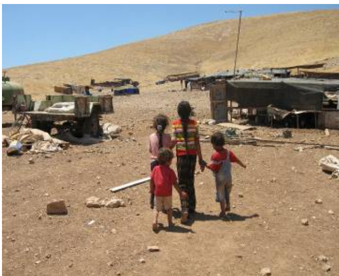
Children in Humsa

In'am Bisharat, a mother of seven children who lives in Hadidiya, told Amnesty International: "We live in the harshest conditions, without water, electricity or any services. The lack of water is the biggest problem. The men spend most of the day going to get water and they can't always bring it. But we have no choice. We need a little bit of water to survive and to keep the sheep alive. Without water there is no life. The [Israeli] army has cut us off from everywhere. The roads are closed. The road to Tammun, where the children go to school, is only opened three days a week (Sunday, Tuesday and Thursday) and only for half an hour in the morning and half an hour in the afternoon (8 to 8.30am, and 3 to 3.30pm). So the children have to stay in Tammun with our relatives during the week. We don't choose to live like this; we would also like to have beautiful homes and gardens and farms, but these privileges are only for the Israeli settlers and we are not even allowed basic services."