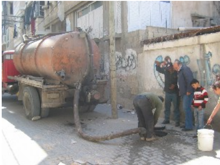
Cesspit being emptied in Gaza

The pollution of the Mountain Aquifer is a subject of contention with the Israeli and Palestinian sides each accusing the other of causing it. In practice, both sides have failed to comply with their obligations and they have both failed to take adequate measures to stop and reverse the damage.