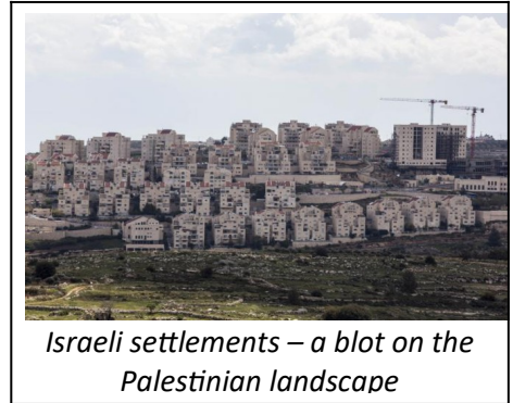
Israeli settlements – a blot on the Palestinian landscape

Settler politicians are the most extreme racists in Israeli politics. Now they hold senior government positions.